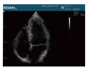
Harmonic imaging produces excellent myocardial border