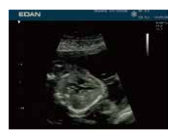
Evaluation of the fetal heart demands exquisite detail resolution