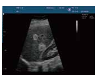
High frequency imaging provides the Spatial compounding and speckle reduction enhance contrast resolution to clearly delineate hepatic lesions