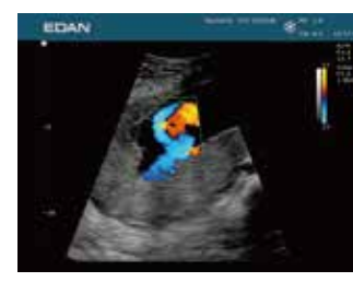
Hemodynamic information is clearly seen in this second trimester umbilical cord