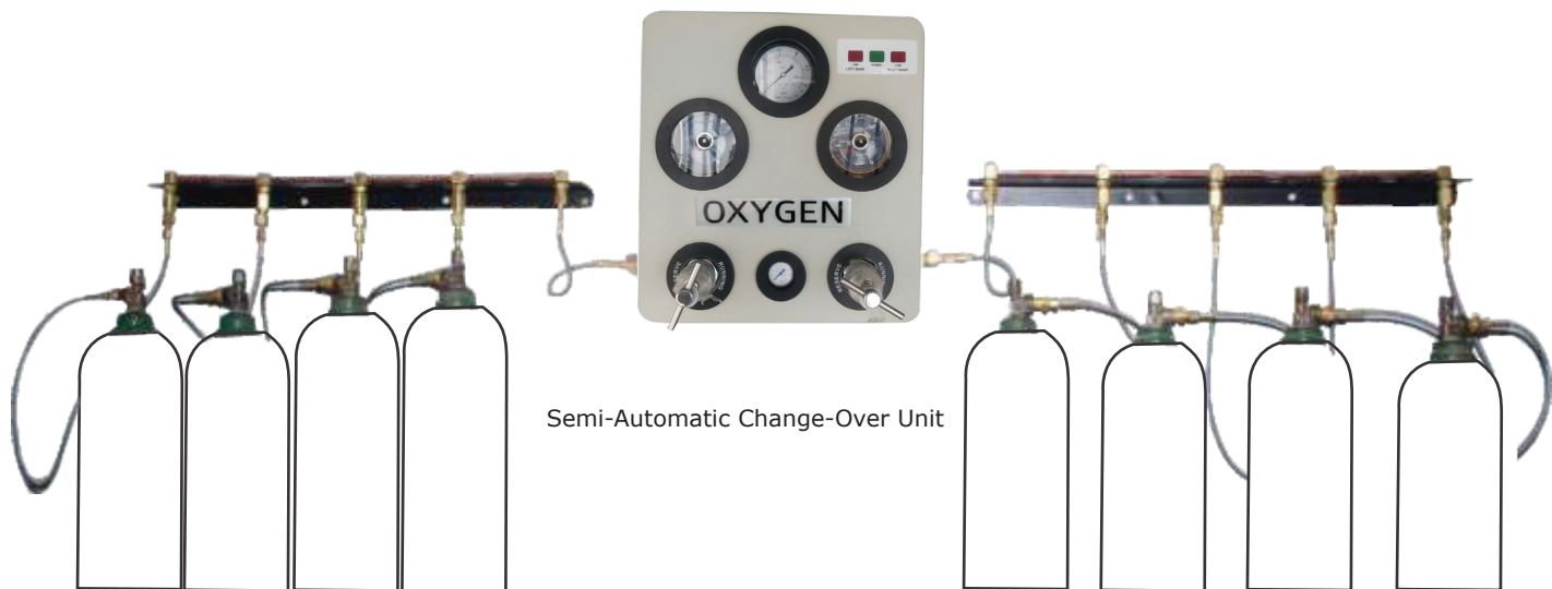
Semi-Automatic Change-Over Unit

Automated Control panel is a panel attached to 2-4 banks having multiple gas cylinders. Automated Control Panel System contains analog pressure meter for displaying pressure of each incoming bank and mainline gas pressure. As soon as the gas in one bank runs below set pressure, it sounds an alarm and switches to the other bank. Specific colored LED lights indicate the bank in use and the bank on standby. The device also indicates whether the gas pressure is in normal or low along the banks and the mains